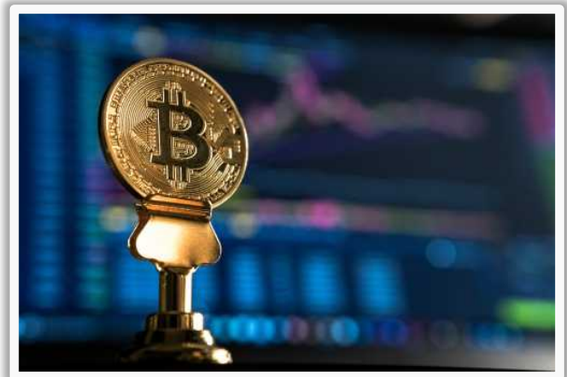
Speak to your WeCovr contact today to find out more!

For more information, please contact WeCovr on info@wecovr.com or by phone: +44 203 797 1287